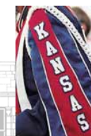
EXCELLENT FACULTY AND STUDENTS