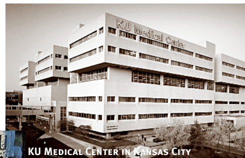
KU MEDICAL CENTER IN KANSAS CITY